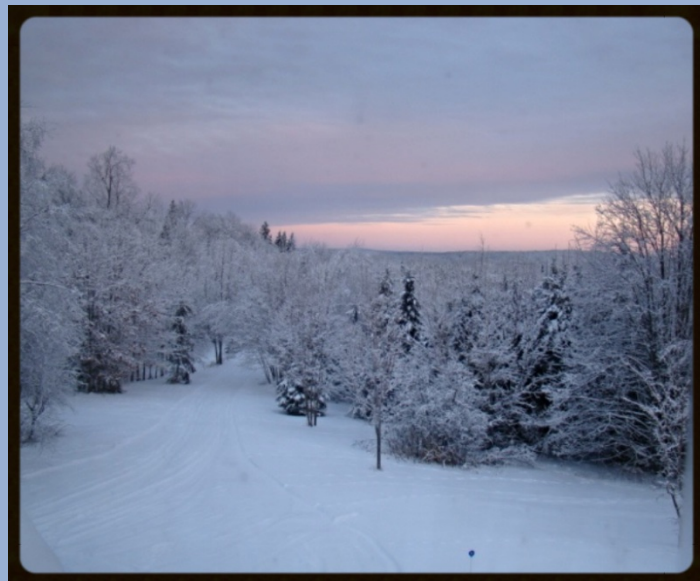
Dusk in Winter - Bancroft, ON

The OMFRC "Facebook Community" is now over 1,000 strong. While this is only a small fraction of the organizations membership we are overjoyed with the growth of this page. As many of you already know Facebook is a great way to stay connected. It has never been more