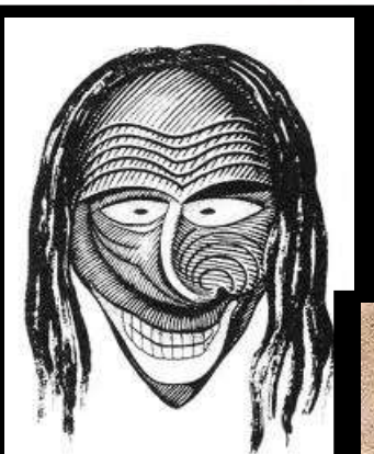
Iroquois wooden mask

If it is, call 1-613-332-4789 and you can do it right over the phone in just a couple of minutes.