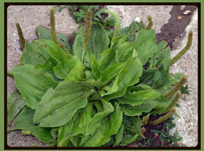
Wild Plantain Stuffing

This little weed is one of the most useful medicines on the planet.