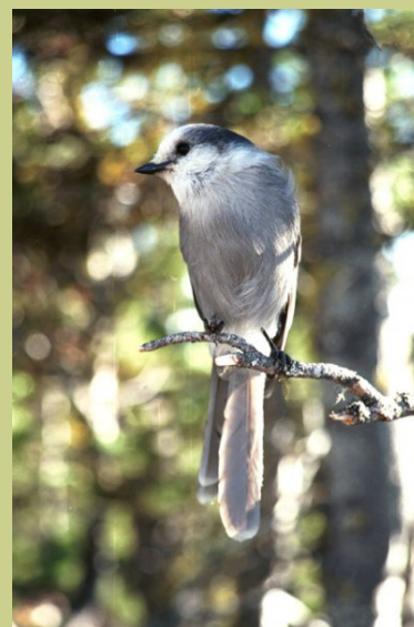
New National Bird of Canada The Gray Jay

Gwiingwiishi has lived with us since the beginning. She is a life giver, a trick player and one of the smartest beings in Creation. Everything she does challenges thought and perception, gifting teachings of responsibility, relationships and life.