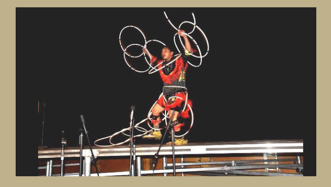
T he first ENNS Aboriginal (Indigenous) Culture Celebration was such a success!

Our school community and visitors are very fortunate to have received a snap shot of the authentic of the land and Indigenous Worldviews. Moreover, it was a good day for Indigenous and non-Indigenous people to come together and become more aware of valued cultural experience.