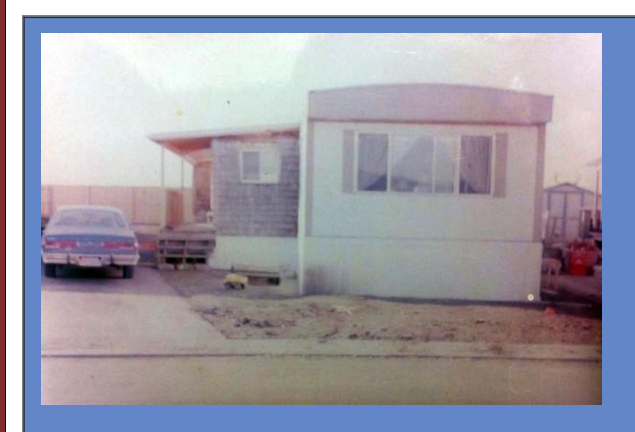
Before the closet A faded dream of what we once were It was a rough journey to this golden place Fresh moose hide draped over the hood of a car like a table cloth