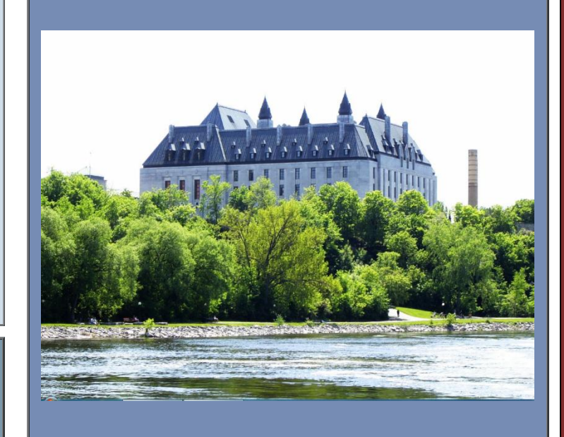
Read the full ruling

For the OMFRC - Painted Feather Woodland Metis, a community of over we have been doing to advocate for our people on multiple fronts. We join in celebration with all of our brothers and sisters from all the Metis nations across Canada.