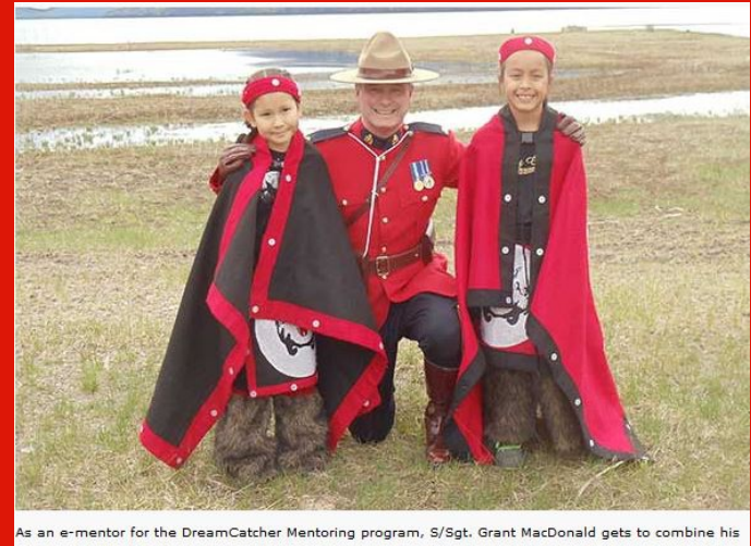
passion for youth, policing and the North.

The OMFRC "Facebook Community" is now nearly 1,100 strong. While this is only a small fraction of the organizations membership we are overjoyed with the growth of this page. As many of you already know Facebook is a great way to stay connected. It has never been more important for our people to stand up and be counted. For far too long the Metis people have been disregarded. The secret has been kept too long it starts with you - pass it on!