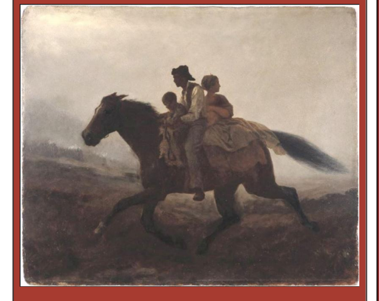
Sophia Pooley - black slave of Canada, her story told in 1856