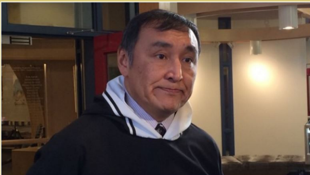
In an emotional statement, Paul Okalik resigned from cabinet in Iqaluit Thursday.

"My heart is with my territory my fellow Inuit and as a alcoholic I understand the challenges they face and I could not in good conscience continue with what will happen. That is my limit".