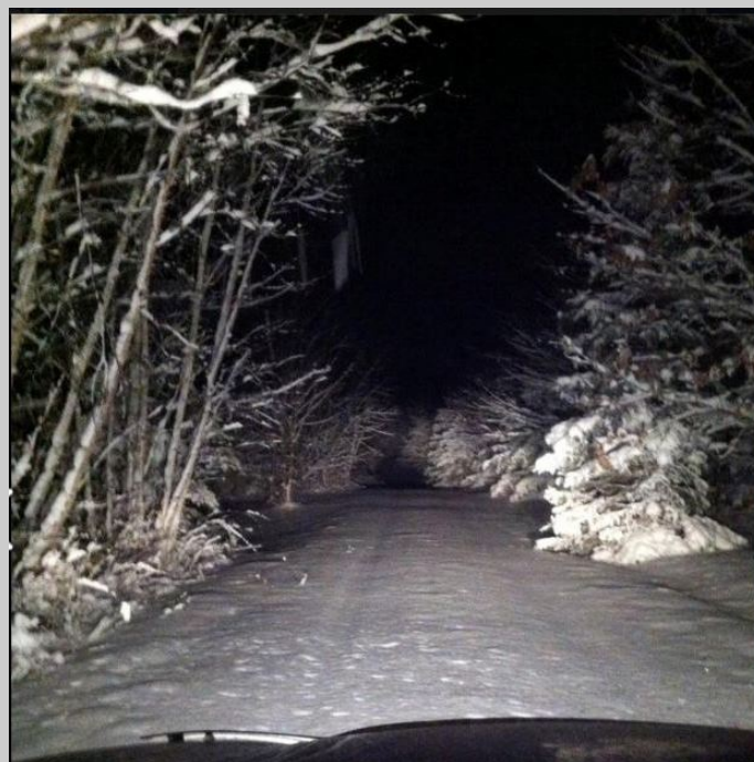
Photo: Country Roads at Night, Bancroft, ON