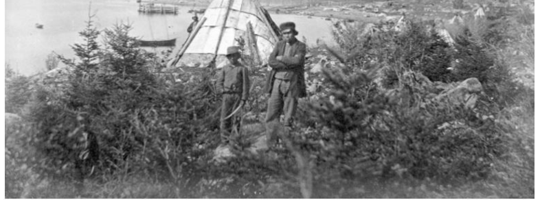
This circa 1871 photo shows members of the Mi'kmaq community at Turtle Grove.