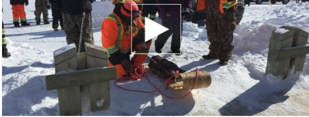
Man drags oxygen tank on toboggan for 17 days in protest 0:36