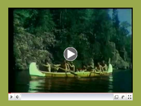
Voyageurs pt 1

A long lost film of a canoe trip from Thunderbay to Winnipeg done to celebrate the 1970 Manitoba Centennial. People who went to Camp Kandalore in Haliburton will see a contingent from that camp in the film. Note: Due to the fact this video is older the quality may not be up to today's standards.